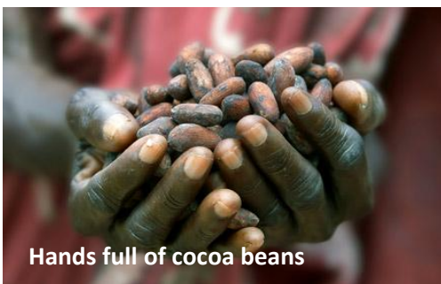
Hands full of cocoa beans

Chocolate is one of the world's favourite foods but growing cocoa is a hard task.