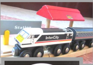
Toys set out ready for the crèche