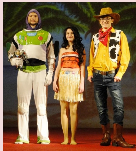
Buzz Lightyear, Moana and Woody

A big thank you to the 100+ children and adults who worked so hard to bring this amazing and entertaining journey to life before our enraptured eyes.