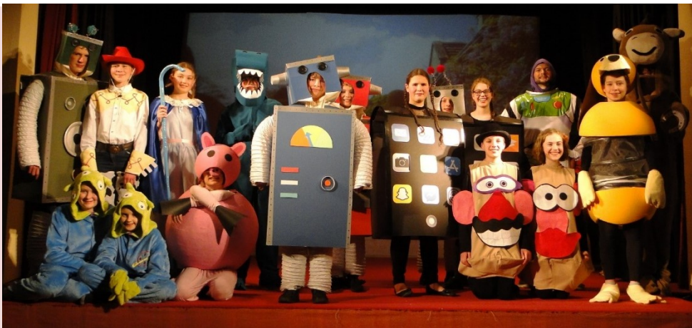
The Older Toys, including your favourite characters from the films