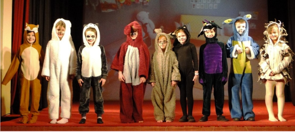
The Cuddly Animals