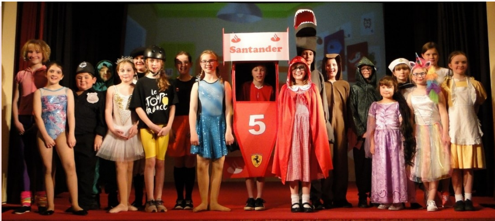
The Younger Toys, including Barbies, Dinosaurs and their Friends