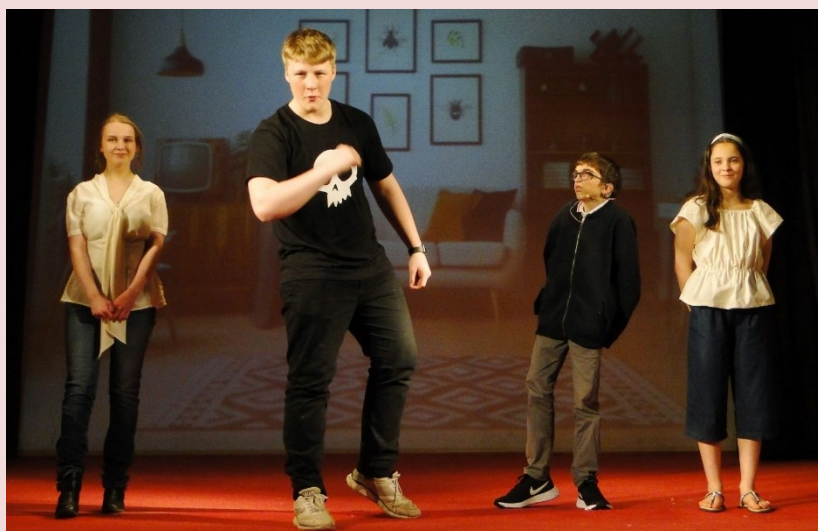
The Humans: Mrs Davis, Sid Phillips, Andy and Molly