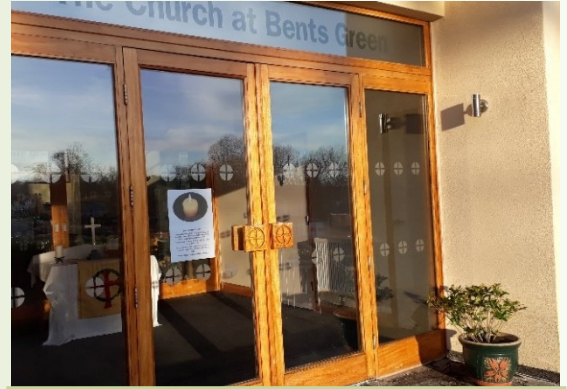
The doors to the church at Bents Green, currently closed due to Coronavirus, but with an invitation to pray and light a candle in our homes