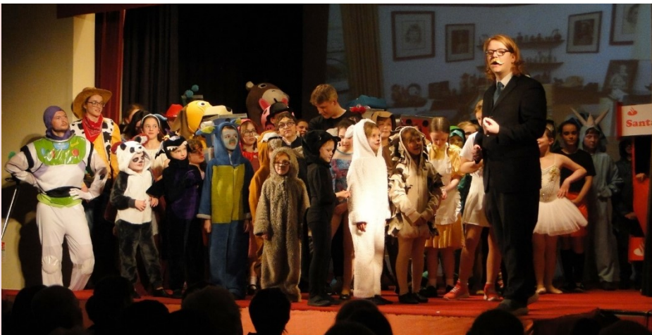
Walt Disney with all the cast