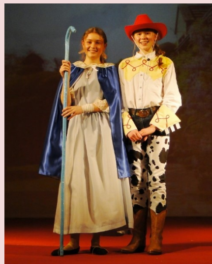
Bo Peep and Jessie